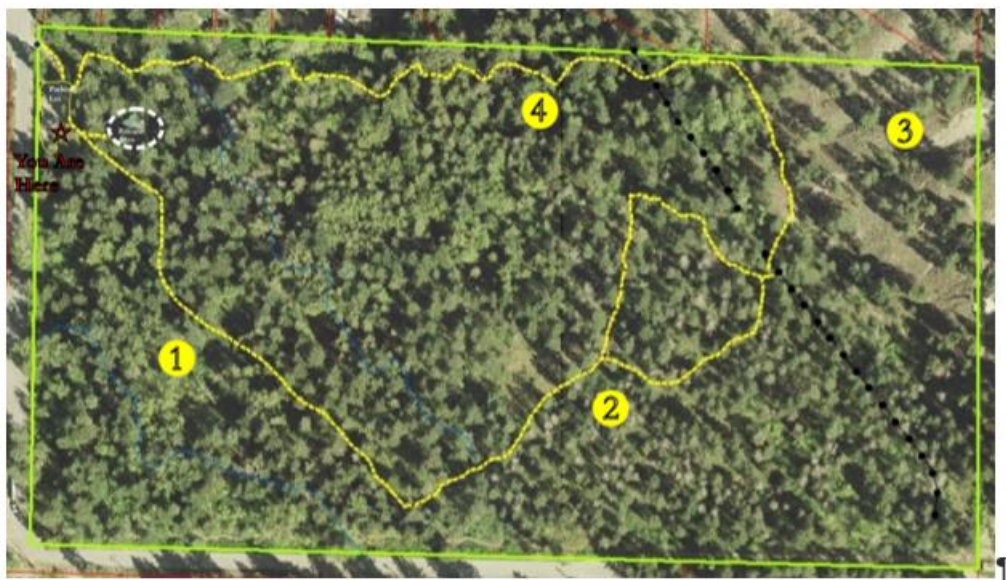
Figure 2: Bio geoclimatic zones in Woodhaven Park: Zone 1 black cottonwood zone, Zone 2 Douglas-fir zone, Zone 3 ponderosa pine zone, and Zone 4 western red cedar zone