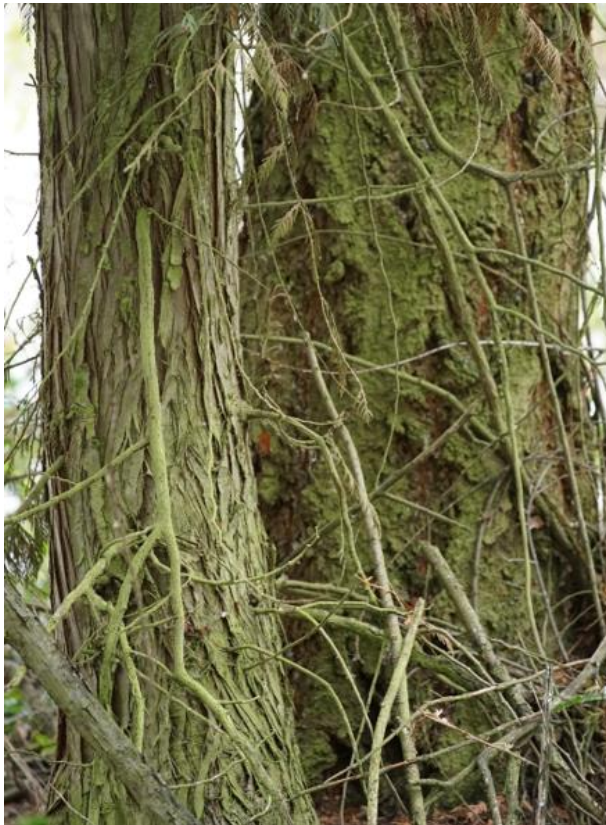
Figure 4: Western red cedar (left) and Douglas-fir (right) trunks