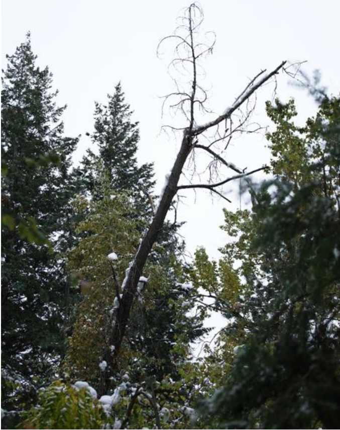
Figure 5: Dead tree (wildlife tree)