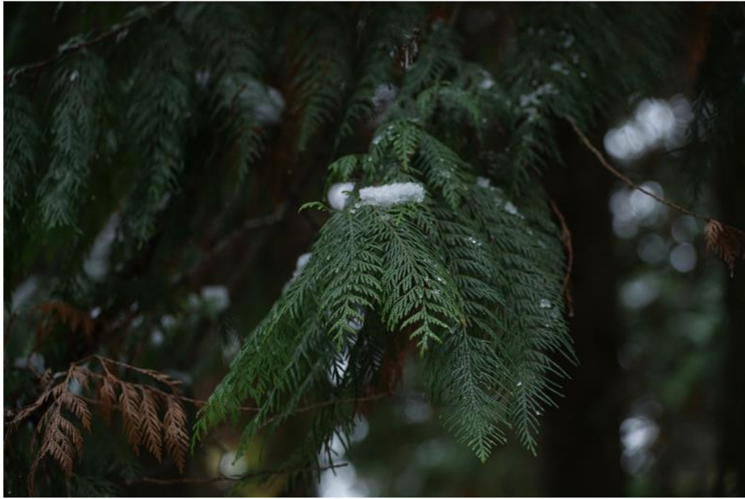
Figure 3: Western red cedar branches