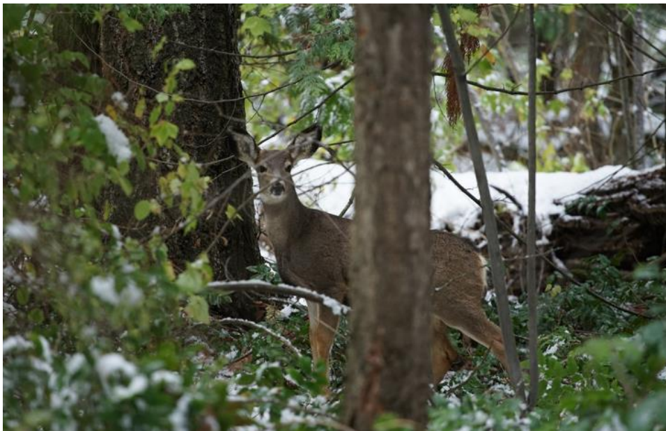
Figure 7: Deer in woods