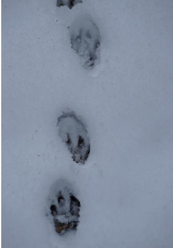
Figure 6: Unidentified tracks in snow