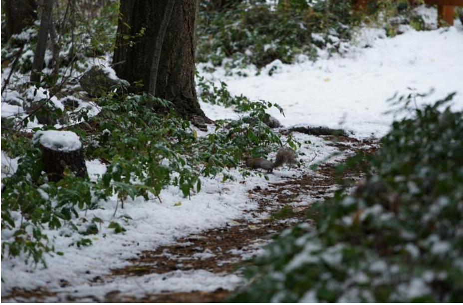
Figure 8: Squirrel on path